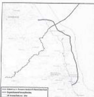
Map of proposed sites

The total length of marine cabling between East Lothian and Durham is 176km.