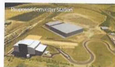
Proposed Converter Station

Field survey work has been undertaken to understand the current landscape features and