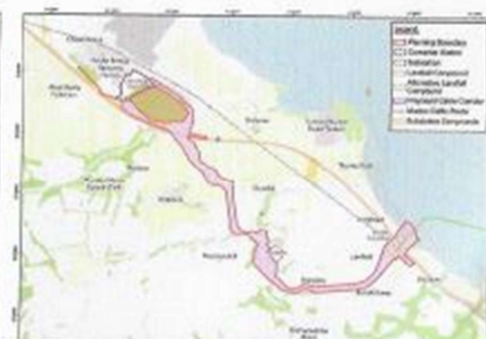
Boundaries of converter station and cables